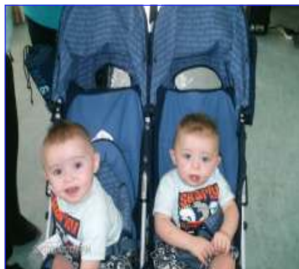
We even had Double Trouble on the day with these adorable twins