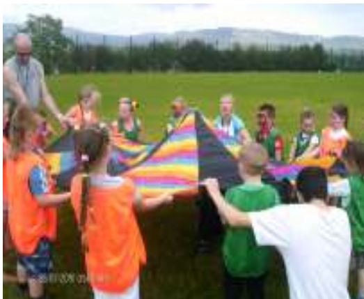
The children really loved this one