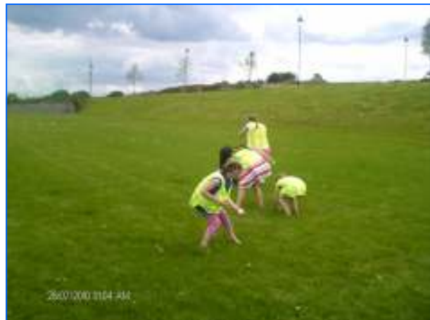
The Girls having a good time with the Egg and Spoon race