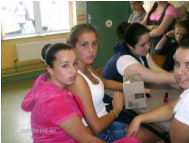
The girls waiting in line to have their nails done

We would also like to congratulate all the children who participated on the day and congrats to those who won prizes for their participation in the activities