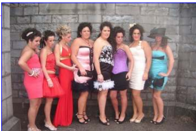
ALL THE GIRLS LOOKING LOVELY ON THE DAY