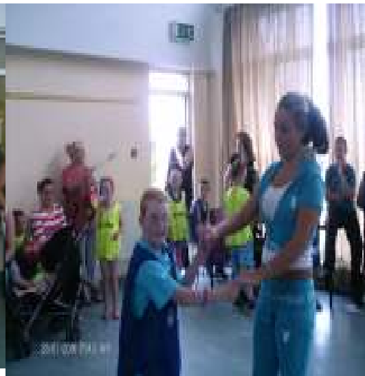
We even had a dance off compaction Girls verses Boys