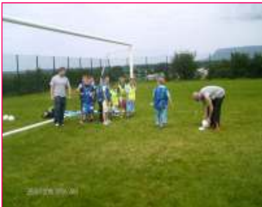
The boys warming up to play football and having a laugh with all the lads